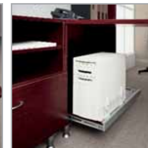
Many table components feature a built-in pull-out shelf to accommodate a CPU and/or printer, fax machine, scanner, etc.